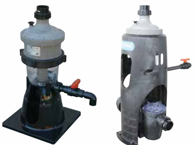
MultiCyclone Stand MKII

The MultiCyclone has two purpose designed support stands to suit all MultiCyclone models and most installations.